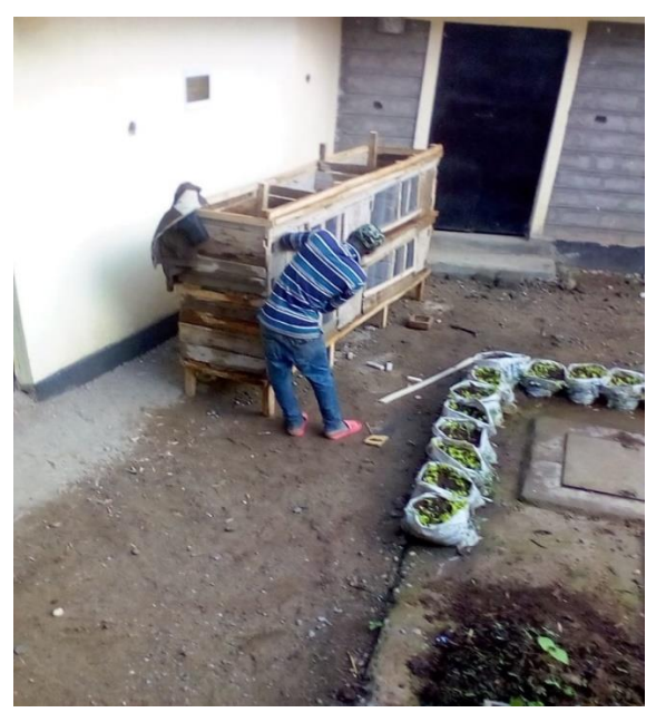
Rabbit hatch construction