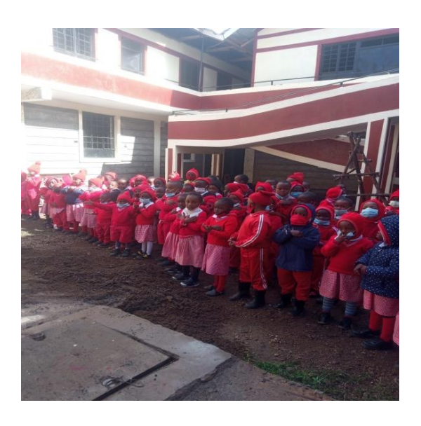
Children outside the school

Shammah has a small land near the school which the founder had bought few years ago but was too small to be developed. The founder donated the plot to the school for the learners to practice farming. By using the plot and boxes made of wood and containers to grow vegetables children and parents have been learning and improving their farming practices . The vegetables have been supporting in the feeding programme in school. The organization is looking forward to start rabbit farming and it has already constructed the hutch for the rabbits animal keeping as part of income generating activity for the school as well as a vocational training Centre for both parents and learners of Shammah and the community as a whole.