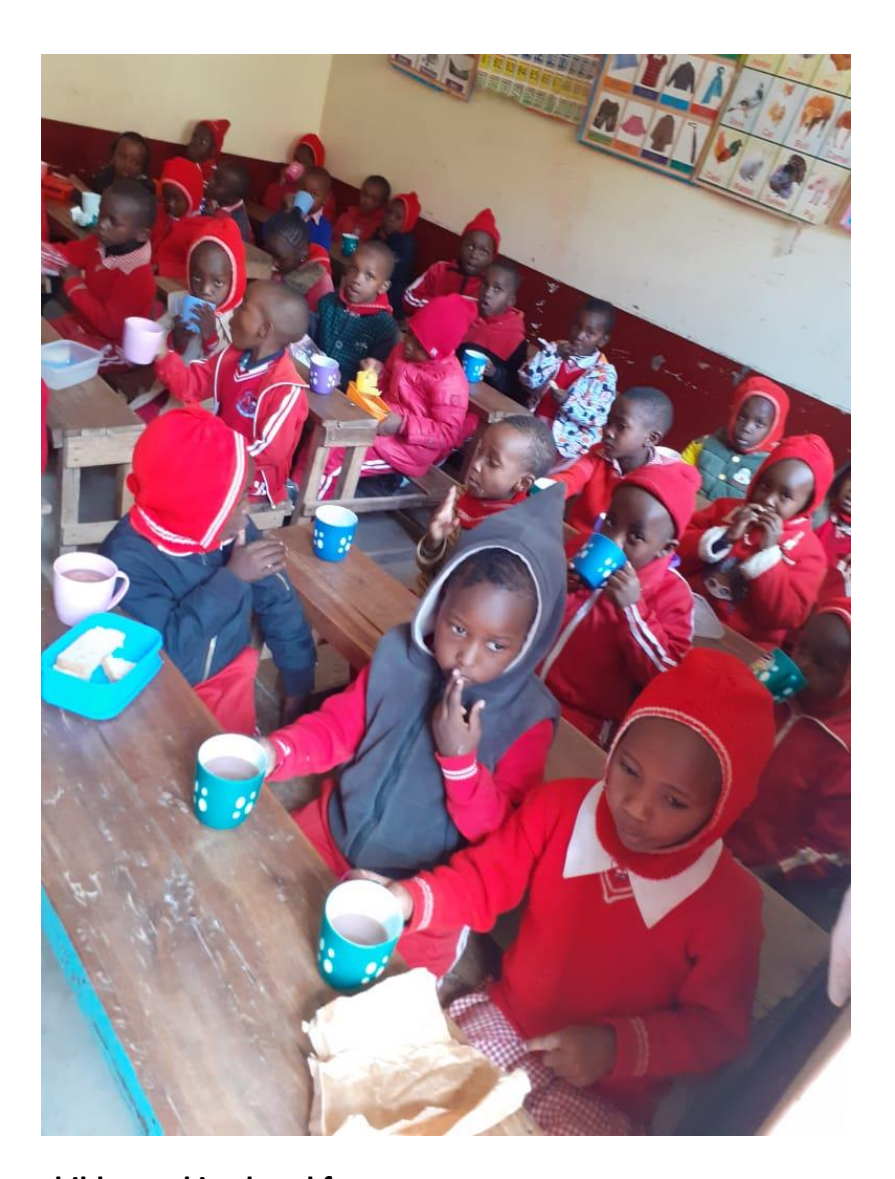
children taking breakfast

vegetables in gunny sacks and containers among others .Children and parents have been learning the practices and improving their farming practices . The vegetables have been supported in the feeding programme in school.