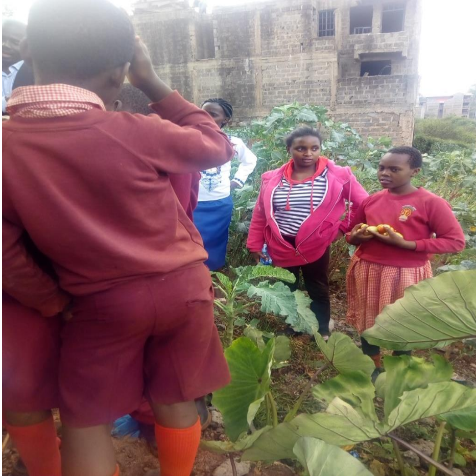
Learners discussing about their products in the school garden