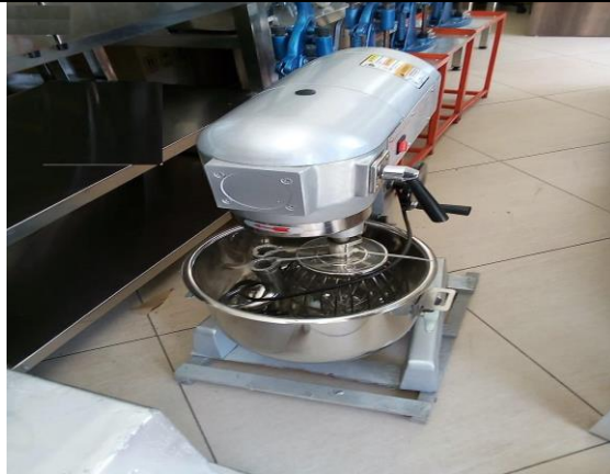
Dough mixer . the size depends on the price