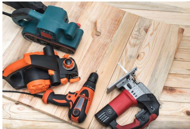
Assorted carpentry tools