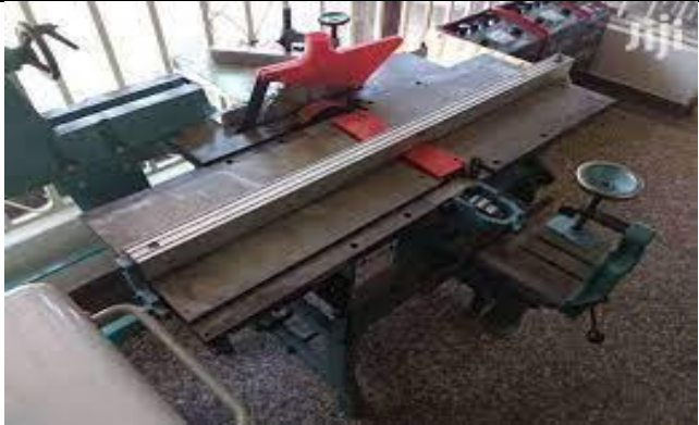
Wood working machine