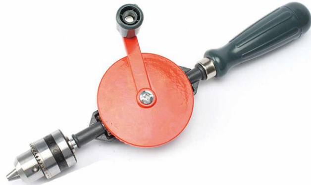
Hole drilling tool