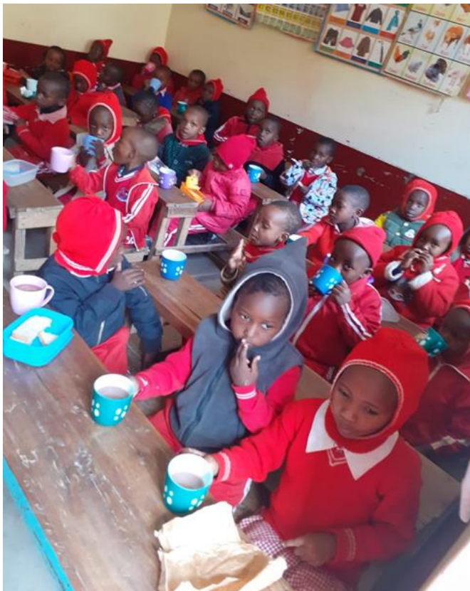
children taking breakfast in Kalimani